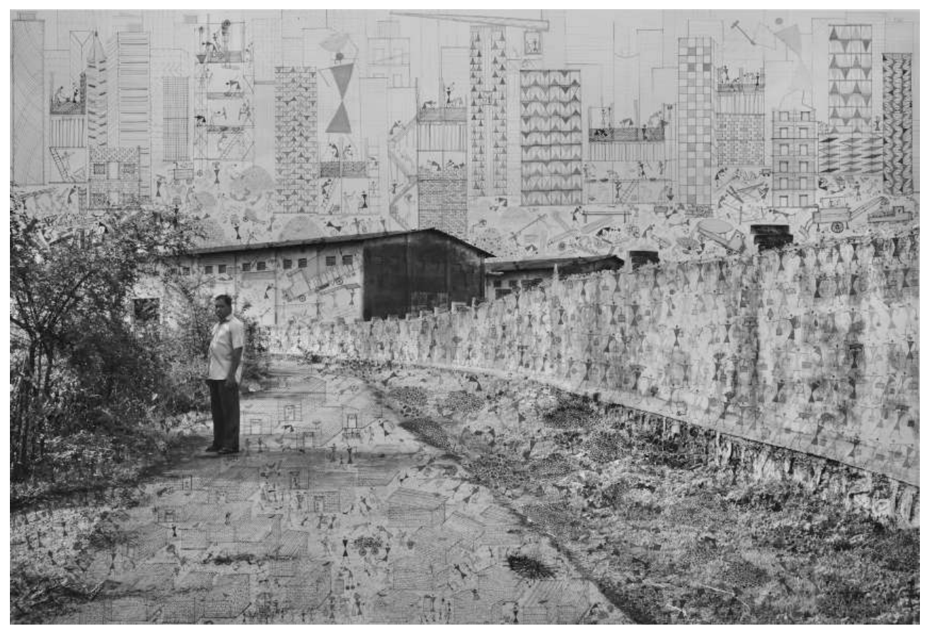
Gauri Gill and Rajesh Vangad - Building the City, 2016, from the series Fields of Sight, 2013-ongoing © Gauri Gill and Rajesh Vangad

images, excluded and muted voices are briefly offered room, showing also photography's potential to reveal what official history conceals, and to rewrite it.