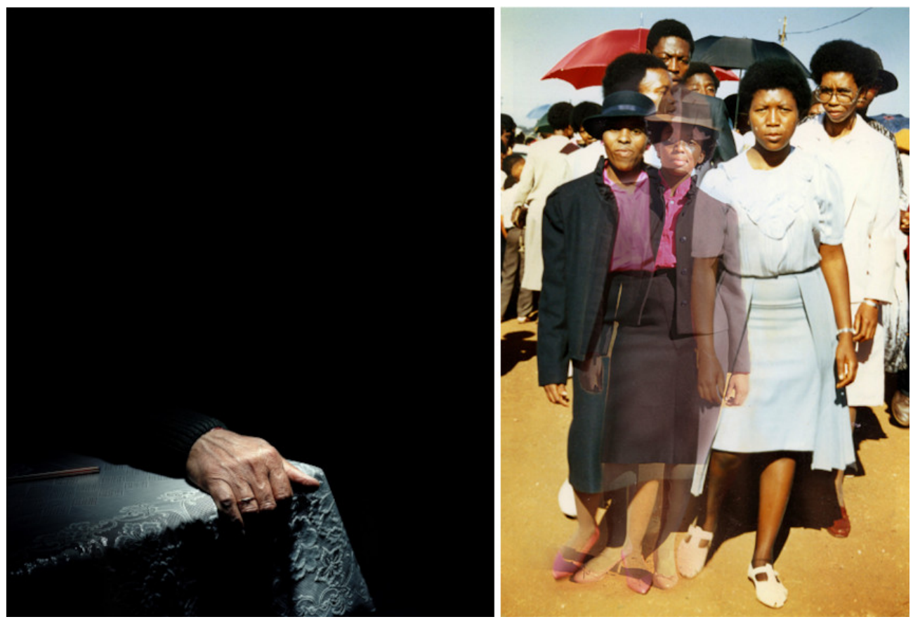
Left: Hrair Sarkissian - Unexposed, 2012 / Right: Lebohang Kganye - Re shapa setepe sa lenyalo II, 2013

Gauri Gill and Rajesh Vangad have been chosen for their publication Fields of Sight (2023), published by Edition Patrick Frey. Working together, the artists have reinvented painted photography, bringing together historical and generational painting practices. The selected project started in 2013, and it depicts the multifaceted realities of Warli life in the region of Dahanu, with Vangad adding intricate drawings to Gill's images. The result is a new visual record that encapsulates multiple truths.